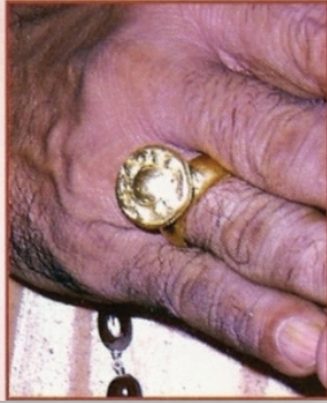
Kanayaazhi - ring used by Swami Manavalamamunigal

"If someone offers Me with pure love and devotion a single leaf or a single flower or a single fruit or little bit of water, I will definitely accept it and will surely save the devotee" Srimad Bhagawad Gita - Shloka 9-26